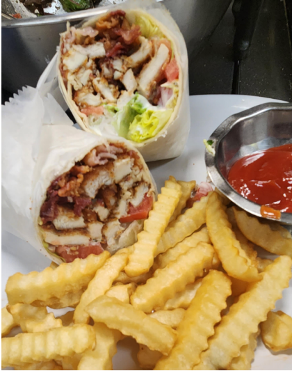
Pictured: The TJ Wrap

Any item below can be made on a tortilla wrap or oven fresh ciabatta bread