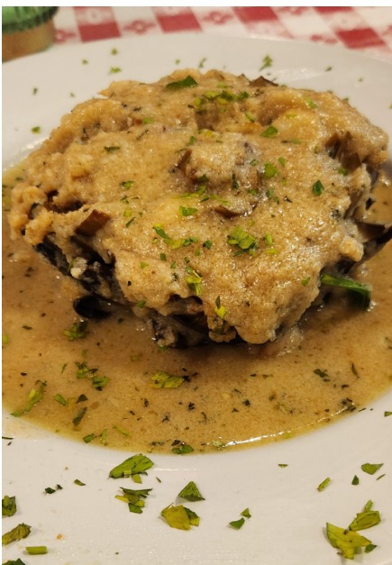
Pictured: Mr Pizzas Famous Stuffed Artichoke Oreganata